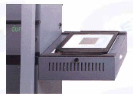
An integrated light table simplifies film loading and centring.