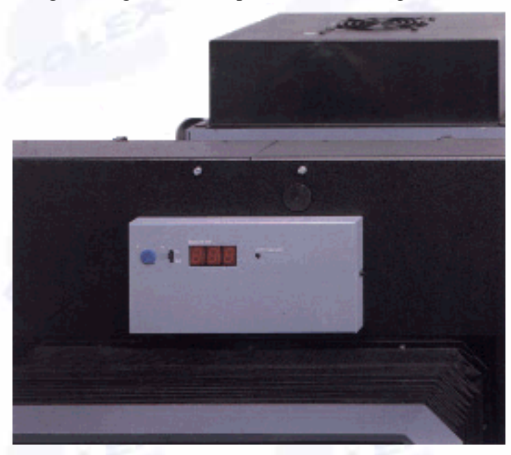
The built-in exposure timer with a range of 0.1-9999 seconds with simultaneous display on the film carrier holder. The exposure countdown is thus visible from the projection surface - useful for shading and dodging work.

Pidam (Picture Data Management) At the serial interface 1 (RS232) exposure data can be read in directly from the Optoscan film scanner, or via barcode by means of a barcode reader.