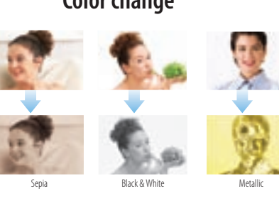
Color images can be easily changed into Black & White, Sepia, or Metallic images.