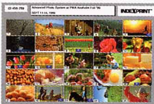
Index Print, 25 Frame (4" x 6")