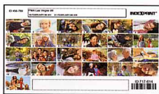
IX240 Index Print, 25 Frame (4" x 7")