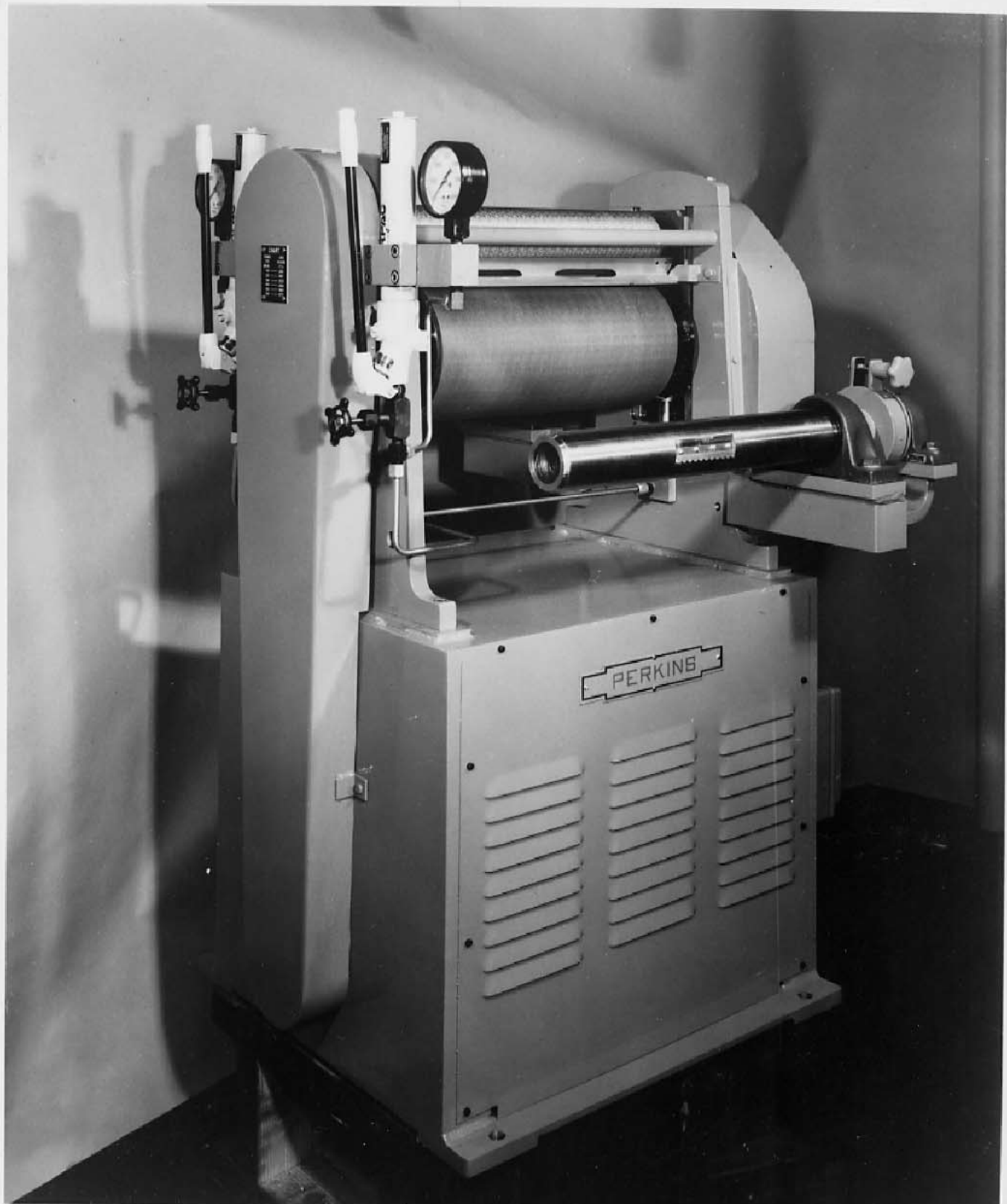
B. F. Perkins Div of STANDARD INTERNATIONAL CORP. 40159