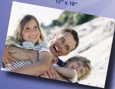
12" x 18"