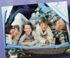
11" x 14"